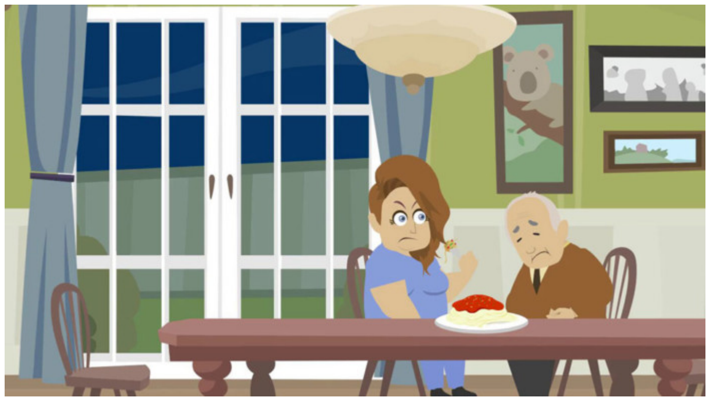
Safeguarding Adults at Risk Download PDF Course Aim

To be able to care for adults at risk, keeping them safe from harm and abuse.